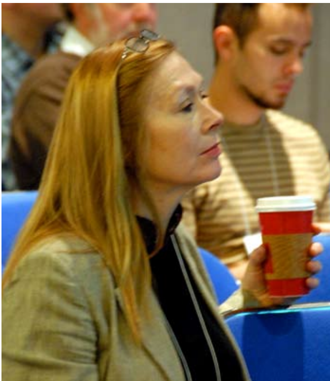
Sometimes a little caffeine is helpful for those early morning sessions!